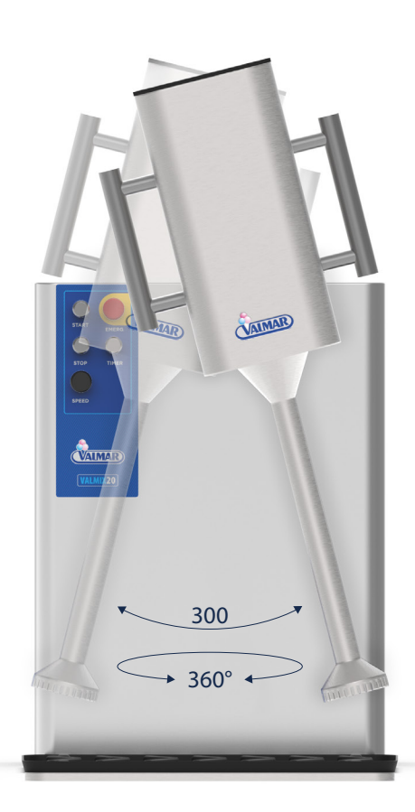
Horizontal and circular swing